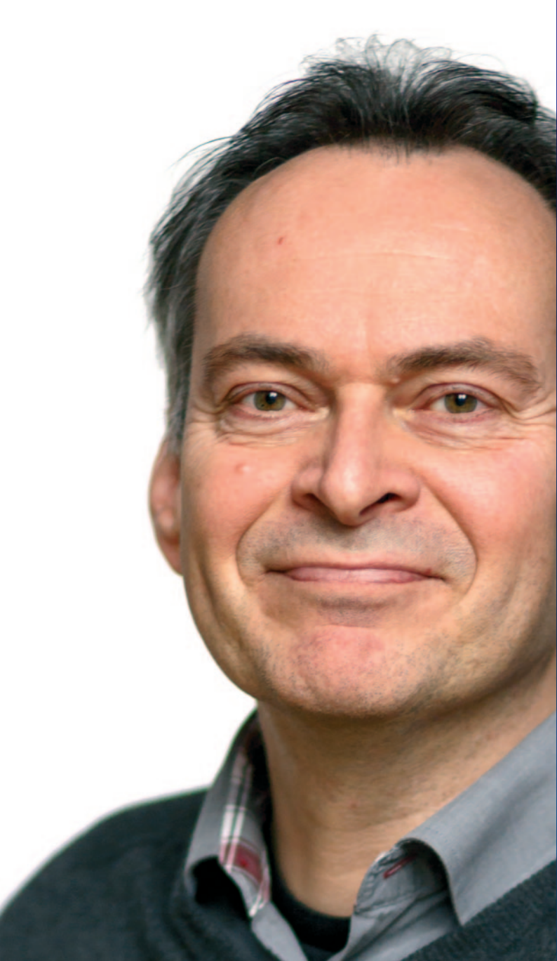
Prof. Alfons van Blaaderen (Utrecht University) on spying on active catalysts

"The activation of methane over a catalyst happens at very high temperatures, but at this moment, the conversion of methane into products cannot be done efficiently. One of the reasons is that the exact chemical pathways at those high temperatures are not well known yet. We plan to observe this catalyst at work during the activation of methane."