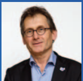
BEN FERINGA Professor University of Groningen