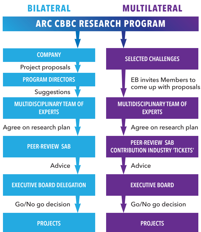
Figure 2: Process of ARC CBBC project selection. In the Bilateral Program Line, 'company' refers to a Full Private Partner. Both Full Private Partners and Associate Private Partners can participate in the Multilateral Program Line.