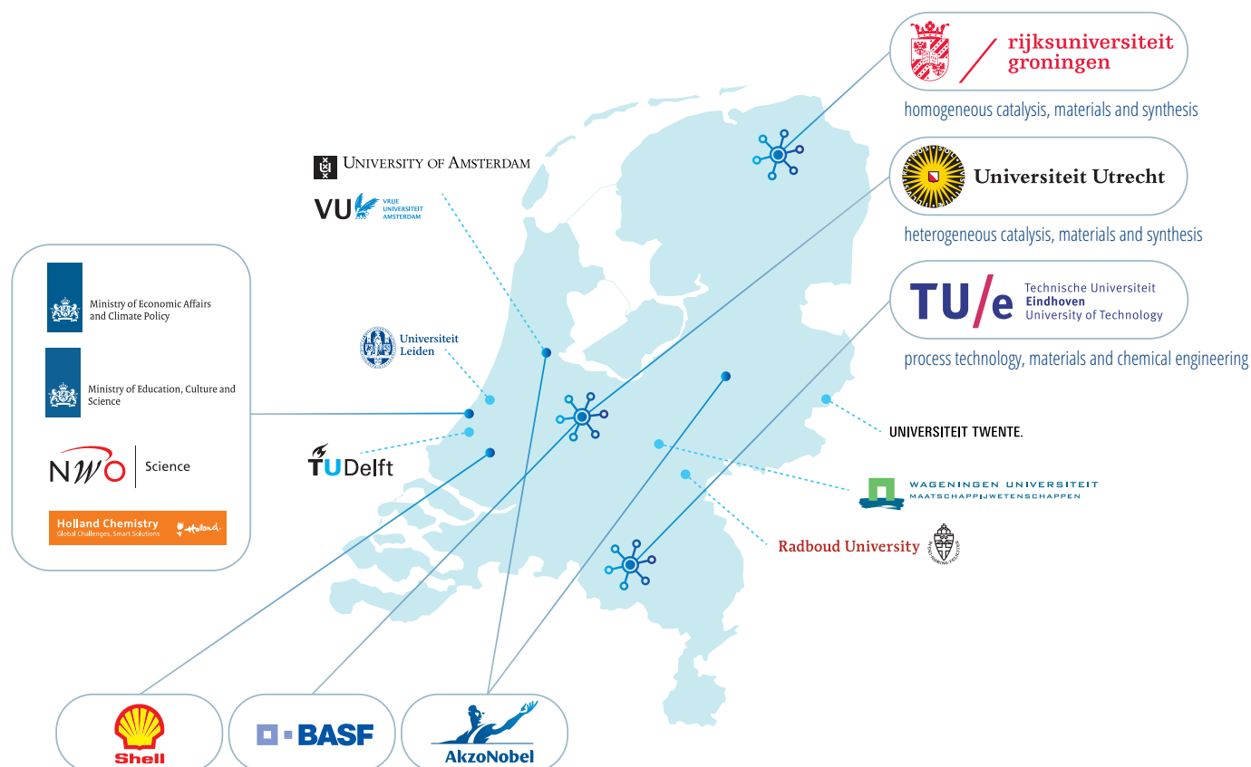
Fig. 4: All current ARC CBBC partners